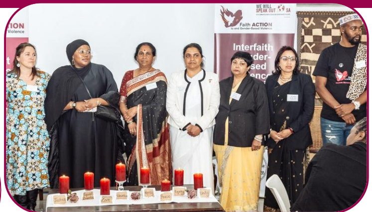
All interfaith gatherings include prayers shared by the diverse faith traditions present